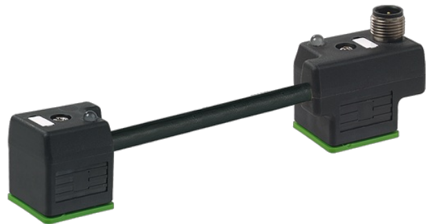
Valve plug 2